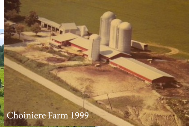
Choiniere Farm 1999